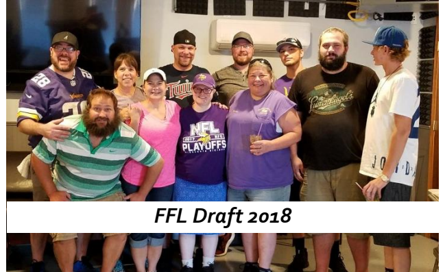
FFL Draft 2018

Please contact me with any activity suggestions you may have!