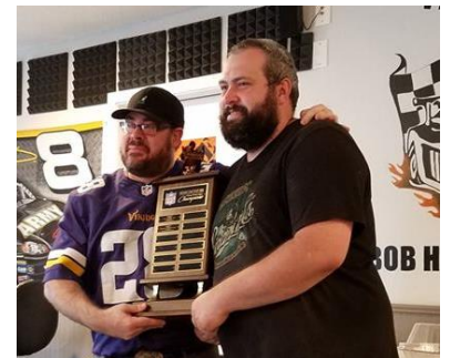
FFL Winners 2017