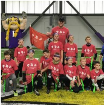
Minnesota Vikings Tight End Kyle Rudolph with a group of United Heroes League Military Kids

When a military recruit signs the dotted line and raises a hand to swear the solemn oath, their service and sacrifice begins. Often unseen, but never forgotten, are the children who make those sacrifices, too. While Mom or Dad proudly serves, these 'little heroes' endure long deployments, extended training exercises and many of the stressors inherent in military life.