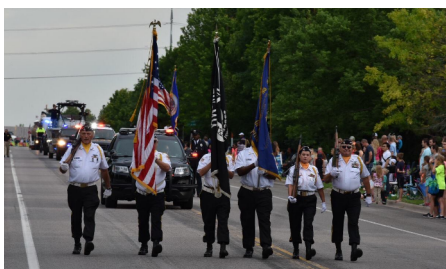
Tater Days Parade