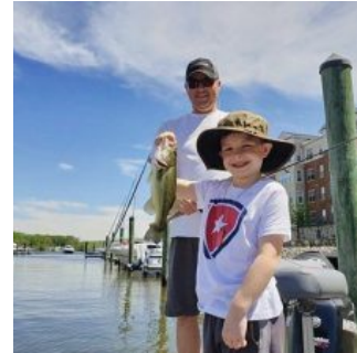
A Military Child goes fishing with UHL Outdoors

The United Heroes League (UHL) would like to honor these children with free sports gear , pro-sports tickets , access to free sports camps , and grants to cover the costs of sports association fees . UHL also provides once in a lifetime experiences to military families, including past trips to Super Bowl 52, the NHL All Star Game and in-person meetings with professional athletes.